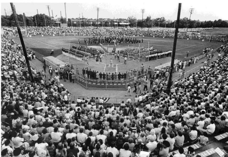
1974 World Championships at Raybestos Field in Stratford, CT

For a story to captivate your interest, you must know the 5 W's. Here they are!