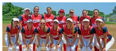
2023 Junior Brakettes